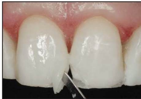
Figure 8. A body shade layer was applied which, again, was kept away from the facial plane to allow for the enamel layer.