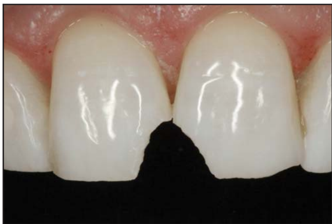
Figure 1. Preoperative facial view of the maxillary central incisors with trauma along the mesial-incisal edges.

Early techniques for resin bonding involved the layering of hybrid and microfill materials to achieve the strength and aesthetics, respectively, witnessed in the natural dentition. 4,5 The handling characteristics, polishability, and shade compatibility of hybrid and microfill resins, however, differed from one another and required the clinician to have a thorough understanding of the indications for each in order to use them successfully in combination. Most recently, microhybrid resins (eg, Venus, Heraeus Kulzer, Armonk, NY; Premise, Kerr/Sybron, Orange, CA; Tetric EvoCeram, Ivoclar Vivadent, Amherst, NY) have been developed in an effort to provide practitioners with a single material that could be applied universally in posterior and anterior regions of the mouth. 6,8 The author uses Venus (Heraeus Kulzer, Armonk, NY) for its shade-matching capabilities and its ability to be easily contoured using various brushes and composite resin instruments.