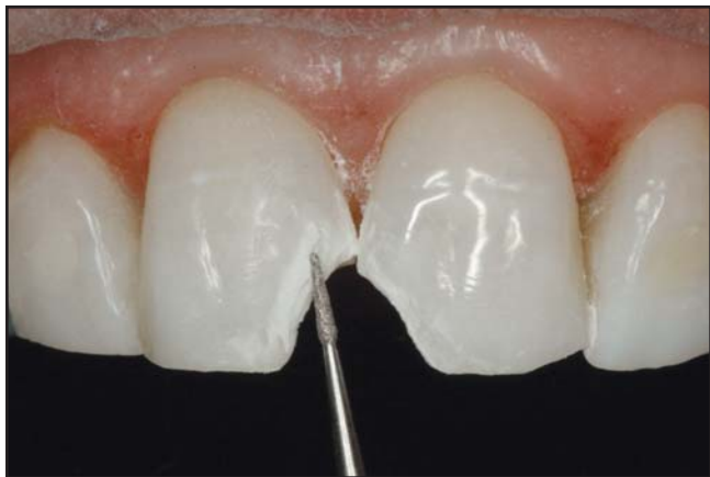
Figure 4. A 4-mm to 6-mm bevel was created to yield a realistic, seamless transition. This technique allows the margin to be camouflaged.