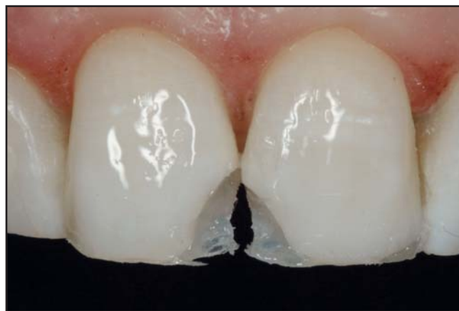
Figure 6. The small layer of composite is light cured and the silicone index is removed.

A freehand mockup of the restorations was created using composite resin. 7 The primary objective of the mockup was to establish the lingual anatomy congruent with the patient's occlusion in centric occlusion as well as protrusive and eccentric movements. When stratifying restorations, determining the exact thickness of each layer can be difficult, and if occlusion had not been verified