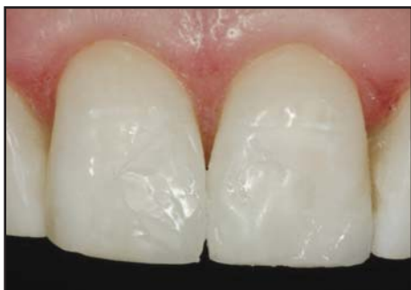
Figure 13. Sculpting of the enamel layer over the beveled facial aspect.