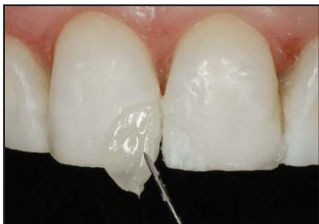
Figure 12. Application of the highly translucent enamel layer.