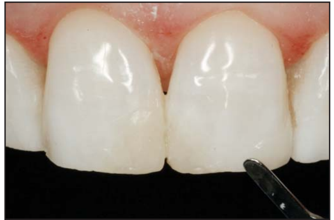
Figure 2. A mockup was created to serve as a model and to verify the occlusion.