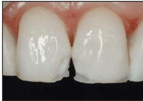
Figure 7. An opaque layer (A20) was placed on the mesial-lingual aspect of the fracture line.

In this Class IV case, it was important to conceal the “transition line” or junction between the natural tooth structure and the various opacities of composite materials.