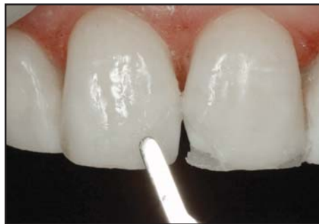
Figure 9. Removal of excess resin to preserve the beveled space for the final enamel layer.