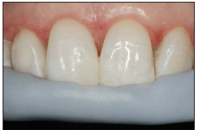
Figure 3. The utilization of a silicone index permits swift build up of the restoration against a supporting scaffold.

Using a detailed case presentation, this article demonstrates the layered application of a microhybrid resin and various tints to replicate the natural dentition in a patient with two Class IV fractures.