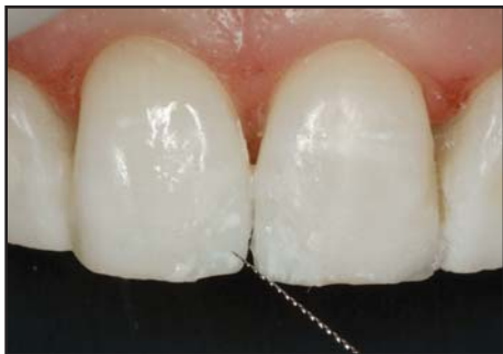
Figure 11. Color characteristics were applied using a #8 endodontic file.