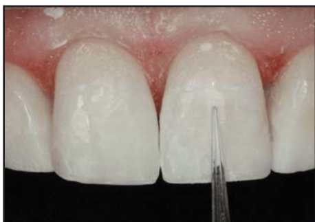
Figure 14. Surface texture was created with the use of finishing burs prior to polishing with finishing disks.

While some clinicians recommend the use of opacious dentin shades that are one to two shades darker than the final target shade, 9 the author prefers to use dentin shades with the same basic shade as the overlying enamel layers and the final overall shade. One must always remember that if this deeper dentinal layer is placed thicker than necessary, it could be inadvertently exposed during the finishing process, allowing its color to show through on the surface of the restoration. This could potentially lead to an unacceptable aesthetic result if the underlying layer is noticeably darker than the enamel/body layer. Whereas, if the basic shades are the same, it will not compromise the aesthetics.