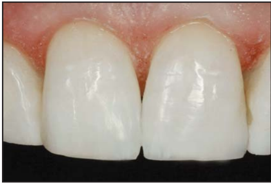
Figure 15. Note the seamless transition from natural tooth to resin material along the fracture line, the incorporation of the tints, and the overall shade and value match.

Block, Axis Dental, Irvine, TX) (Figure 14). A series of polishing discs and strips were used to render the definitive polish for the restorations (Figure 15).