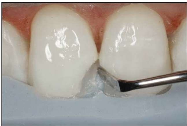
Figure 5. A translucent base layer resin was built up against the silicone index to create the adhesive surface on which subsequent layers would be applied.

dentition and conceals the margin. 10 A bevel design can also offer greater fracture resistance and retention in that it increases the total bonding surface area and allows more restorative material to be utilized. 11 Additionally, a design should be followed that tapers cervically from its widest point incisally. 12